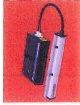
Ionstorm Long Distance Static Eliminators